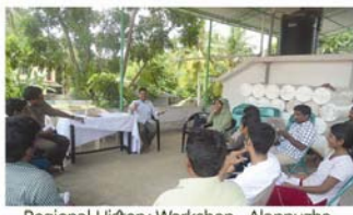
Regional History Workshop - Alappuzha