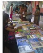
Book Fare in College