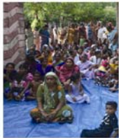
Science Miracle Show