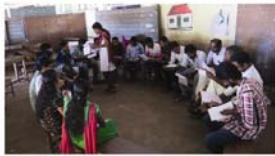
Yuvasamithi Workshop Kollam Dist.