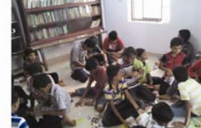
Library - Balavedi- Programme