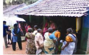
Medical Camp - Tribal Colony -Palakkad