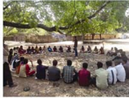
Gender Debate - Palakkad