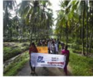
River Study - Malappuram