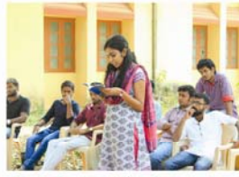
Poetry Camp - Thrissur