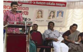
Organ Donation Camp