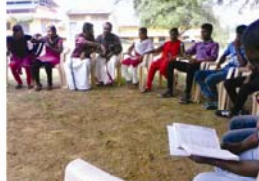
Tribal Area Workshop- Attappady