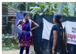
Street Play - Malappuram