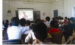
Film Festival - Palakkad