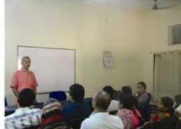
Medical Students Meet