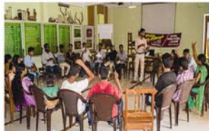
District Eco camp - Thiruvananthapuram