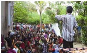
Science Popularisation Class